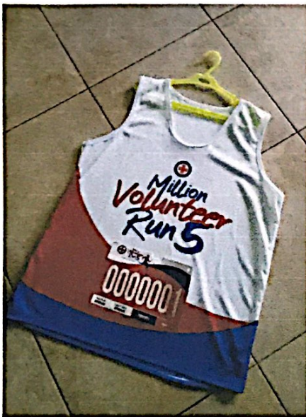
Singlet with Race Bib

PHILIPPINE RED CROSS Surigao del Norte Chapter Surigao City